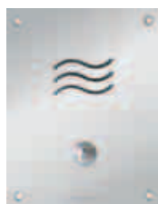
PAN-CPlate Chrome Door Plate (200H x 135W)