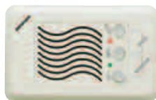
PAN-Q816S White Room Station