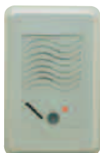
PAN-Q816DS Silver Door Station