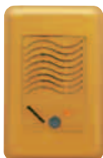
PAN-Q816DG Gold Door Station